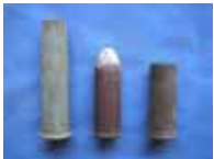
Picture [Left to right] 45-70 Government Issue cartridge, unfired 45 Colt cartridge, 44 caliber cartridge.

Other cartridge calibers have been found along the road and may represent personal guns, civilian teamsters, or later travelers along the road.