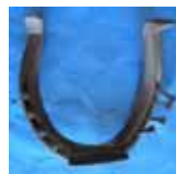
Draft Horse Shoe

In building the "Wagon road" horseshoes and mule shoes are required items for the benefit of the animals used in construction. Most likely, oxen were not used in building the wagon road.